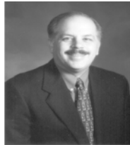
From our Pastor