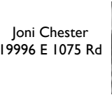
Joni Chester 19996 E 1075 Rd