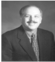
From our Pastor

1600 W Country Club Elk City, OK 73644 (580) 225-7951 June 17, 2010