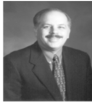
From our Pastor